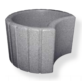
wall retainer unit